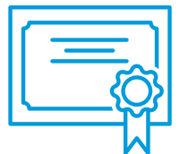
Certificates & Reporting